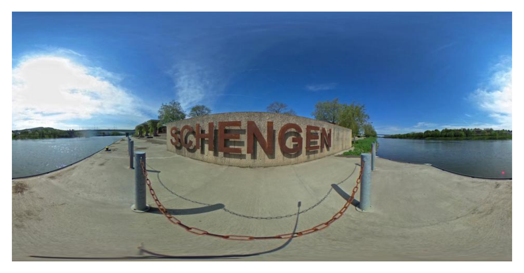
The chains have come down on Europe's usually passport free Schengen zone for European travelers – ... [+]

After four months of travel bans, Europe will soon officially be open to visitors from at least 14 countries. Not the U.S. Nor Brazil and Russia. But Australia, Canada, Japan and South Korea yes.