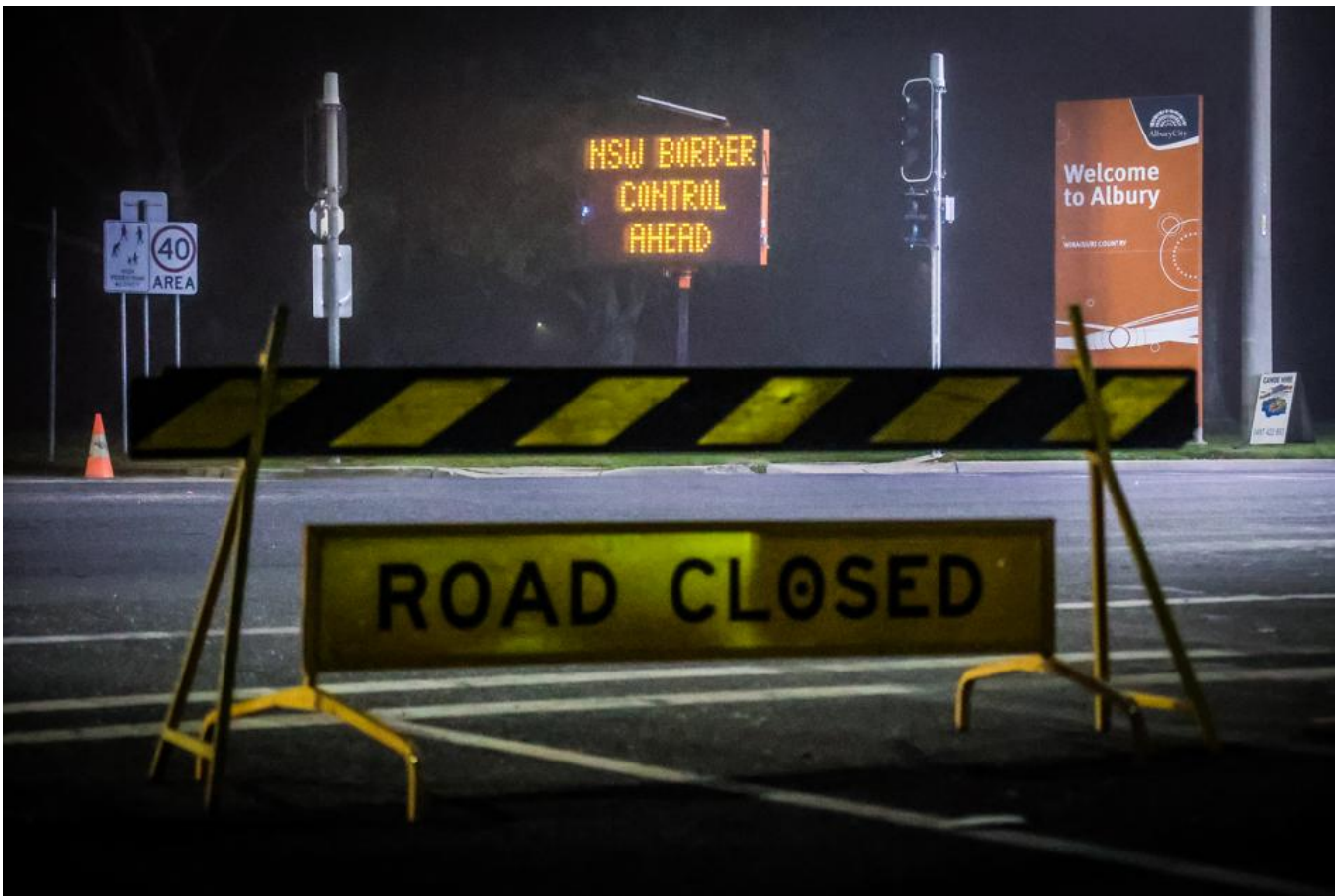
Road signs are displayed near a police checkpoint on July 8 in Albury, Australia. The NSW-Victoria ... [+]