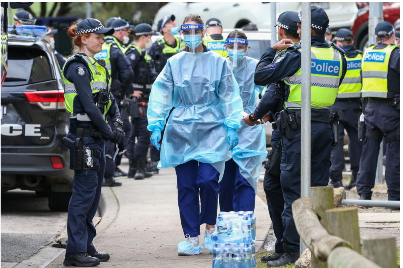
Medical staff at public housing flats in Melbourne, Australia. Amid a Covid-19 testing blitz in 12 ... [+]