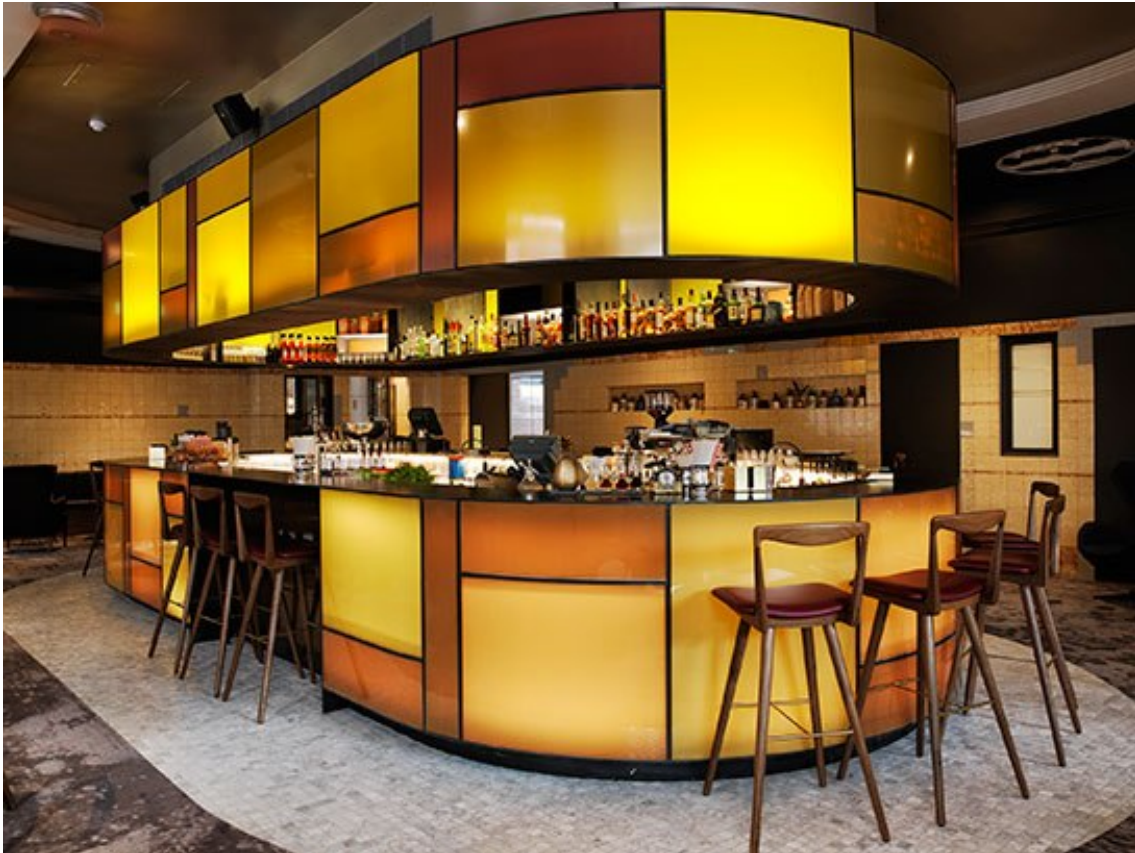
The lobby bar.

converted warehouses. The new hotel, part of the Singapore-based Unlisted Collection, is the centerpiece of a multibillion-dollar urban redevelopment project known as Central Park.