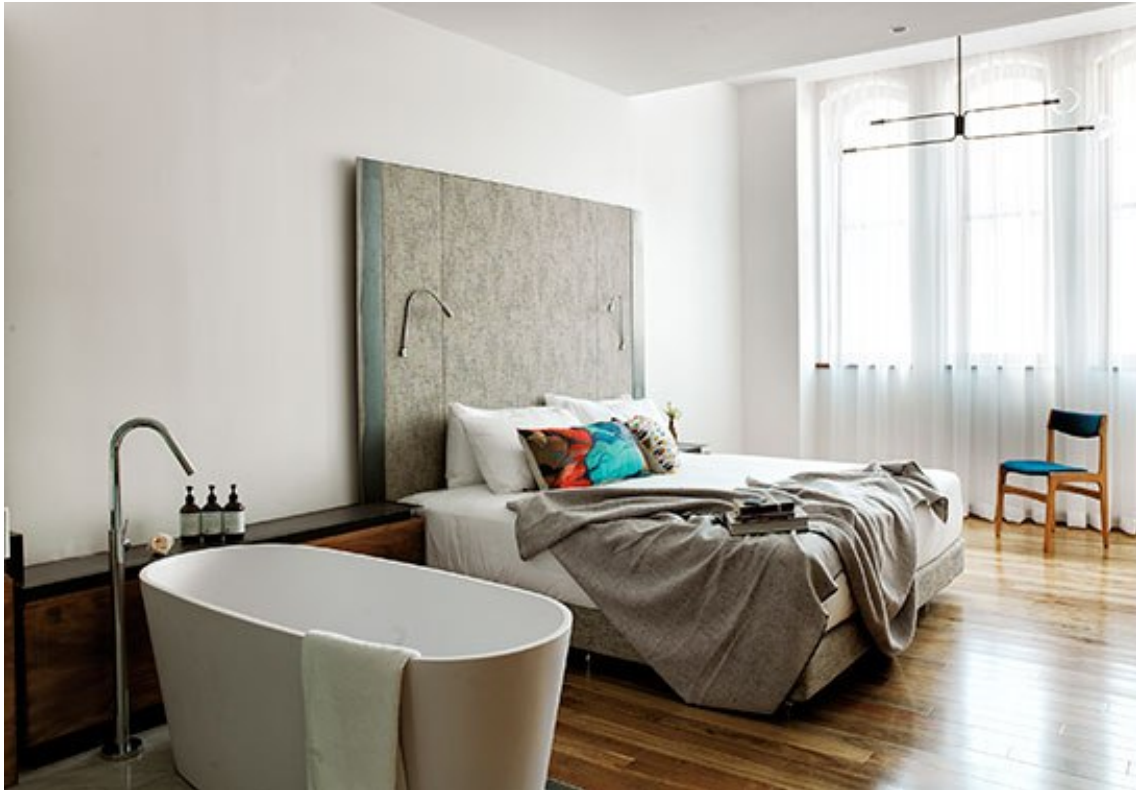
Another guest room features a freestanding tub.

Inside, the 62 rooms breathe the industrial age with their cornices, old timber paneling, and original exposed brick. Soaring ceilings, picture windows, and a mix of vintage furniture, streamlined light fixtures, and custom-made contemporary pieces round out the look.