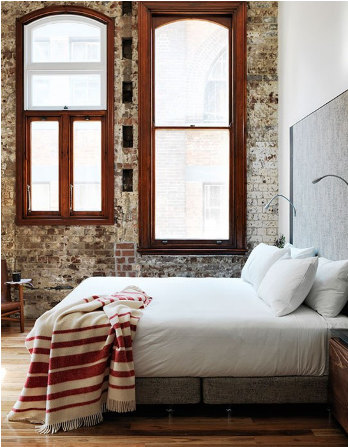
A guest room at the Old Clare Hotel, a new property in Sydney.

Text by Tamara Thiessen | September 17, 2015